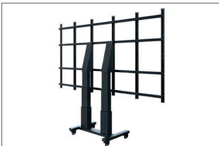
No fine adjustment necessary