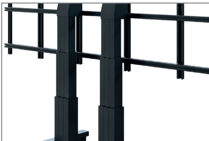
Motorised height adjustment - 700 mm travel way

In addition to the pre-configured systems, HAGOR offers customised special solutions in the LED sector, which can be individualised with accessories such as loudspeakers, controls and so on to meet all requirements.